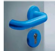
08-1050 \phi 19mm 08-1055 \phi 22mm available in RAL colours