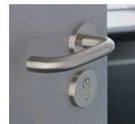
08-1050AL-19mm 08-1050GA-19mm 08-1055AL-22mm

Extended thumb turn and key for the less abled